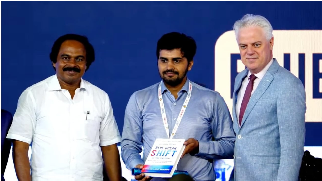
From left: Minister for Information Technology and Digital Services, VayuJal founder, Air-France-KLM General Manager for the Indian sub-continent