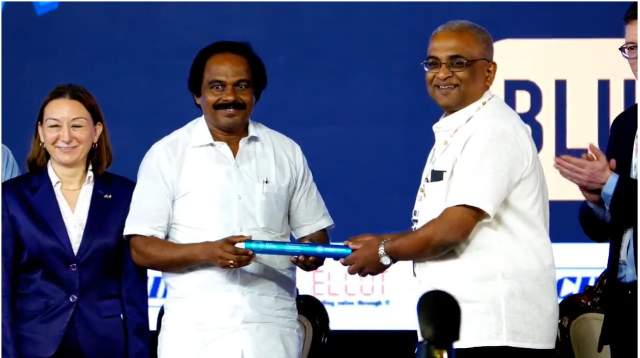
From left: Consul General of France in India, Minister for Information Technology and Digital Services, Government of Tamil Nadu, Founder of aHope