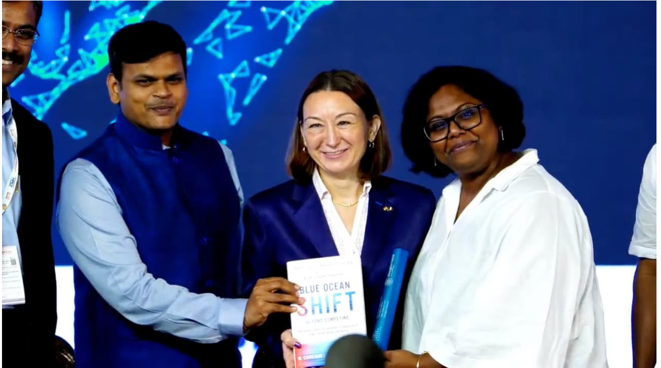
From left: Secretary to Government Information Technology and Digital Services Department, Government of Tamil Nadu, Consul General of France to India, Founder of Ambaram